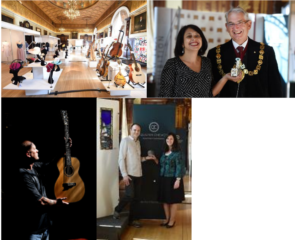
Top Left: the Craftex Exhibition