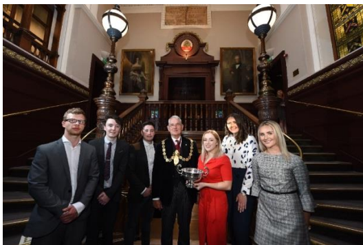
The Deacon Convener with some of this year's GMAA finalists

Visit Trades House's YouTube channel to see the video of the finalists' telling their own stories.