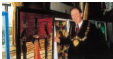
The Deacon Convener with the winning entry in the Decorative Glass category sponsored by J Chandler & Co (Buckfast) Ltd.