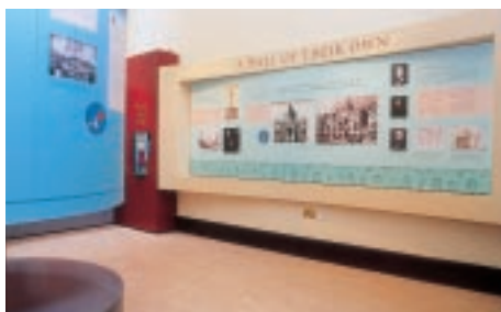
Sections of the Craftsman's Gallery