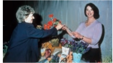
The dried flower display