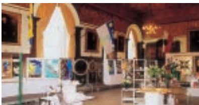
A view of a section of the CraftEx 2003 Exhibition showing some of the display stands provided by Melville Exhibition Services.