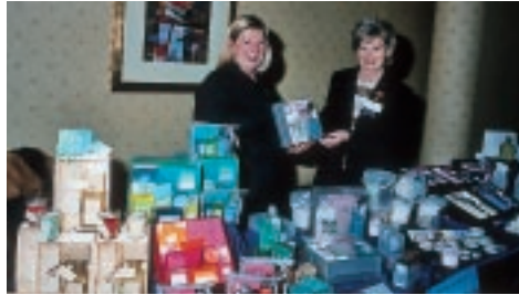
A display by Arran Aromatics