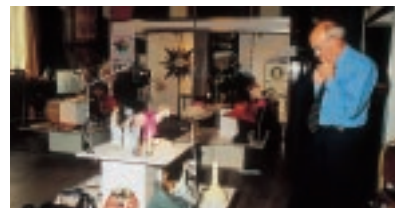
Ian Credland judging the Ceramics category