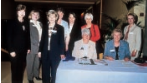
The Ladies Association Committee