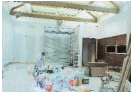
Final painter work underway in the old top floor schoolroom

The imaginative tourist interpretation facilities now being installed include the fitting out of the top floor school room which will reflect much of the history of the House and the Crafts over the past 400 years.