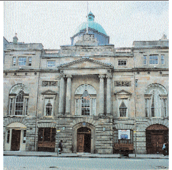
The revamped Hall exterior showing the new windows and entrance

Full details of the completed Hall and all its revitalised facilities will be included in the next issue of the Craftsman.