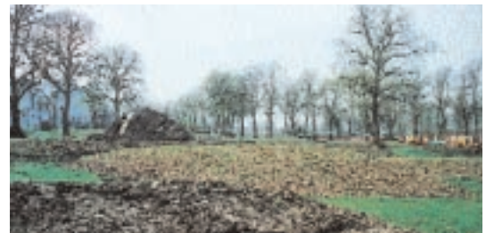
The site at the House for an Art Lover as it is at present.